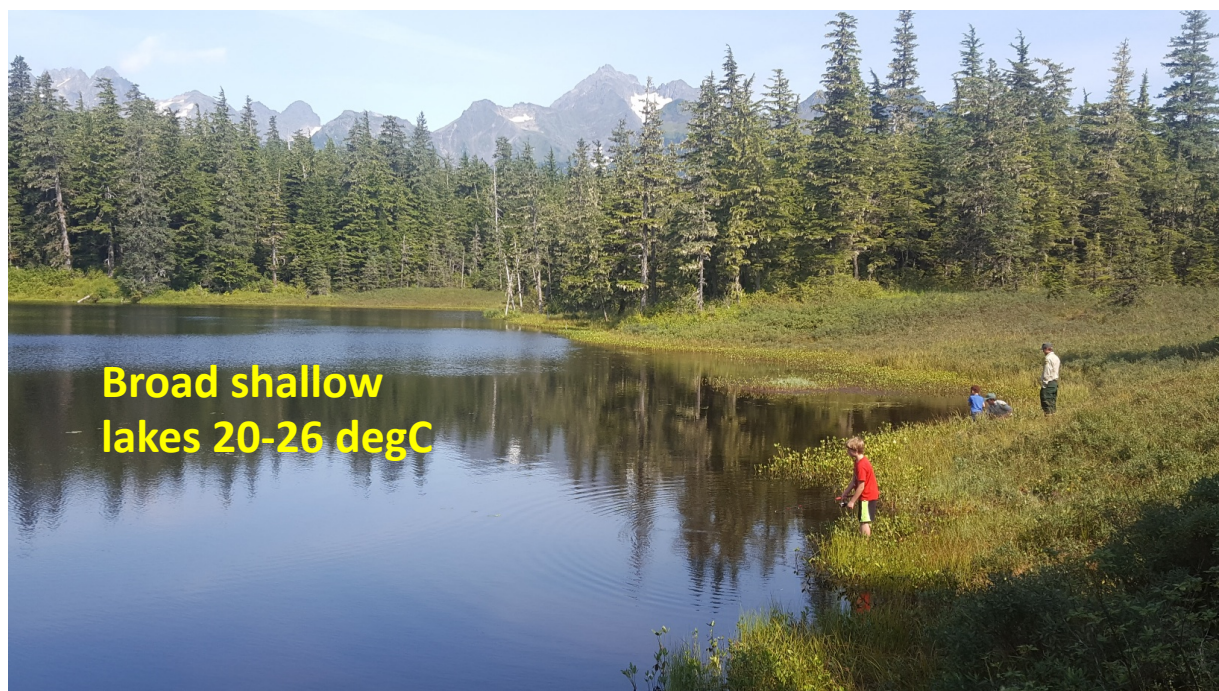
Broad shallow lakes 20-26 degC