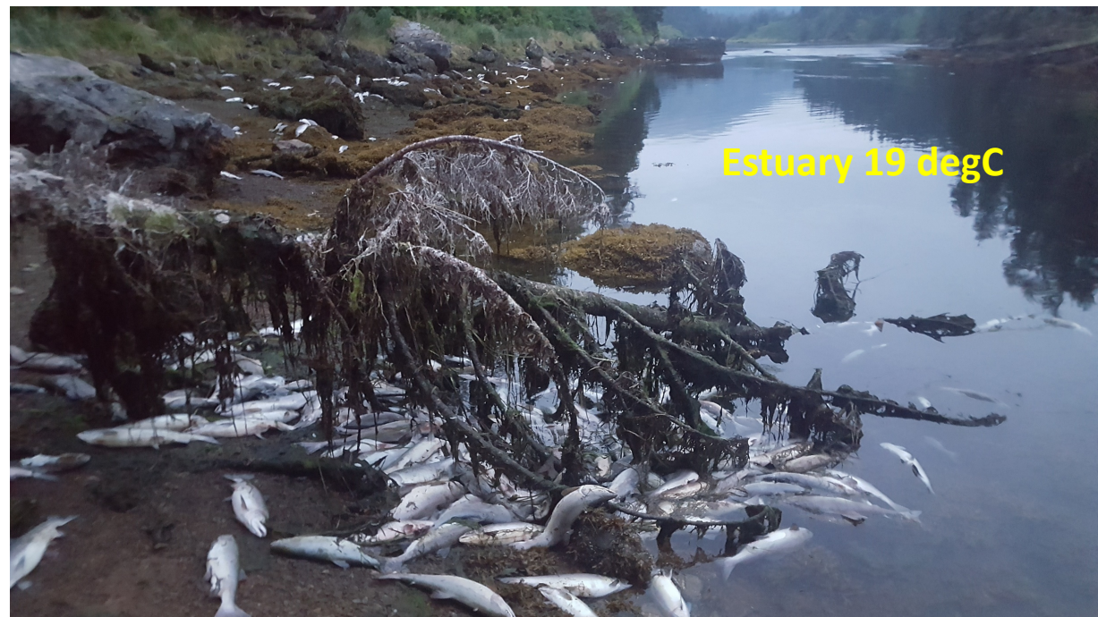
Estuary 19 degC