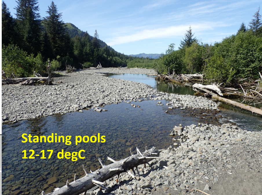
Standing pools 12-17 degC