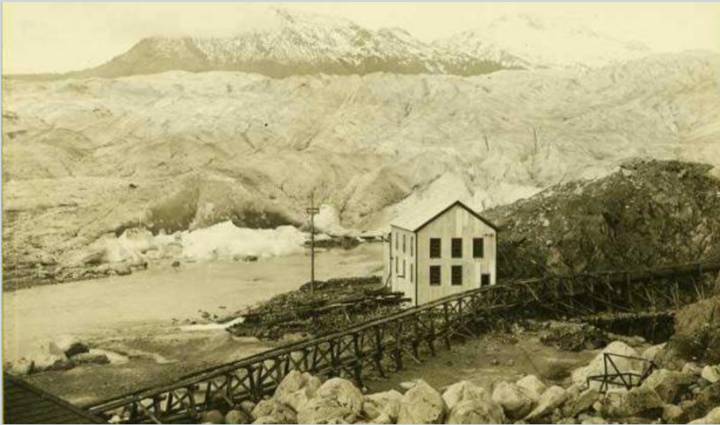
Nugget Creek Powerhouse, circa 1920, Juneau

(1) the benefit to the applicant resulting from the proposed appropriation;