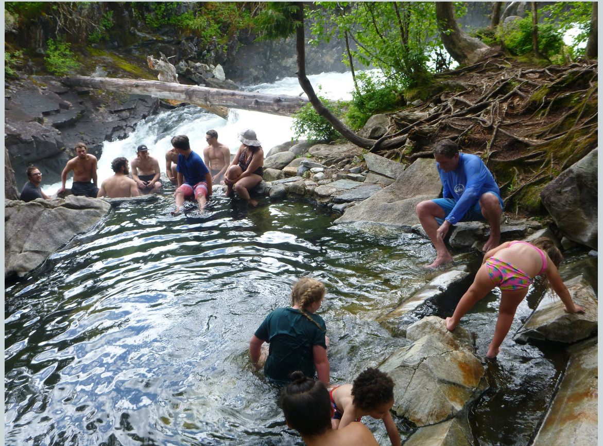
Grotto, Baranof Warm Springs

(3) the effect on fish and game resources and on public recreational opportunities;