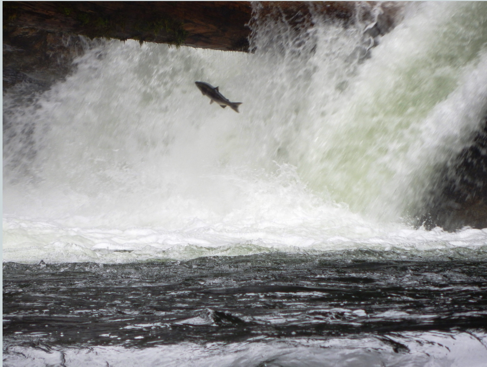
Sockeye Salmon, Sweetheart Creek

(2) the effect of the economic activity resulting from the proposed appropriation;