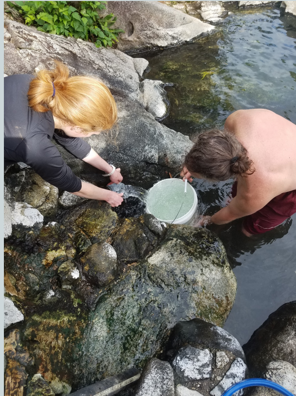
Measuring the flow from a hot spring, bucket and watch method