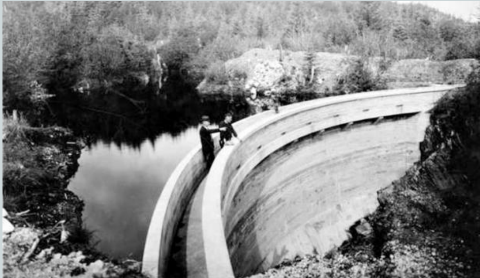
5 th Street Douglas Dam