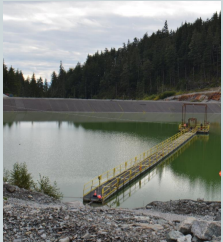
Tailings Pond, Kensington Mine