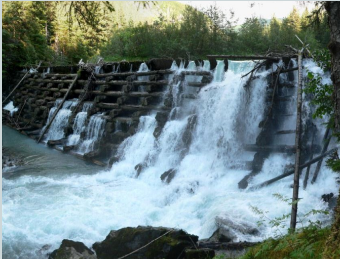
Nugget Creek Dam, completed 1915